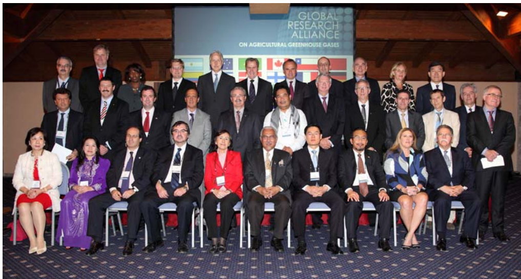
Heads of Delegations at the Alliance Ministerial Summit

This report is a summary of Summit participation and proceedings.