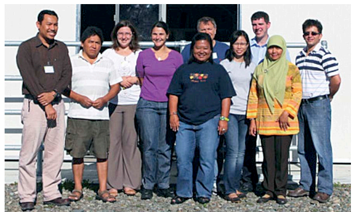
Participants in the technicians training course in New Zealand.

emissions from enteric fermentation and to develop a collaborative approach to reducing GHG emissions attributed to pastoral farming.