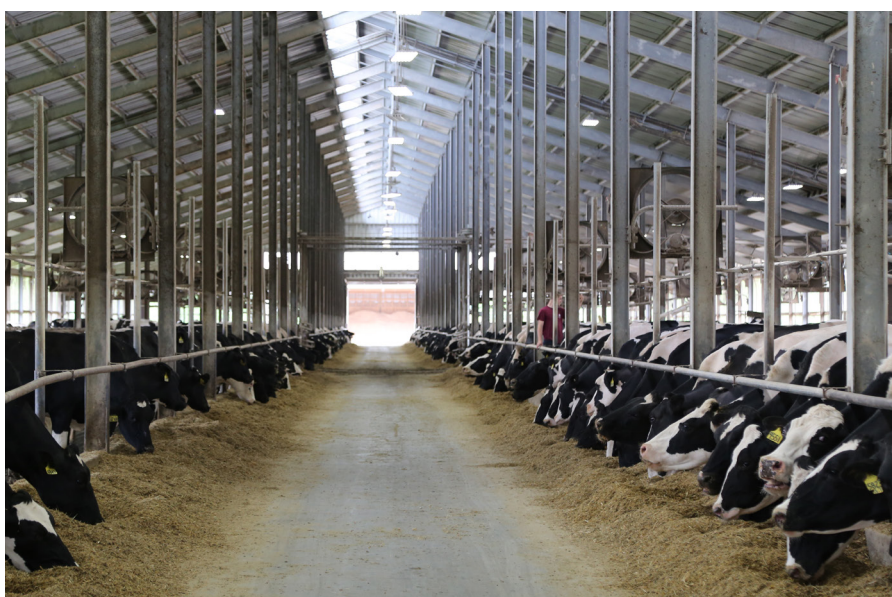
Intensive dairy farm in the Eastern United States

These gains in animal productivity have led to a leap in feed efficiency, which in turn resulted in a 55% decrease in enteric methane emission intensity. It is logical that methane emissions per animal have increased in 2014, compared with 90 years ago. For example, based on extrapolated USEPA (2015) emission factors, a dairy cow emitted around 60 kg enteric methane/yr in 1924, whereas in 2014 an average dairy cow emitted 144 kg/yr. This large difference is explained by the larger size and much greater milk yield of the modern Holstein cow. Both of these factors contribute to greater feed dry matter intake, which is driving enteric methane emissions in ruminant animals. Total enteric methane emissions have increased by about 5-6% in 2014 compared with 1924, an equivalent of close to 71 million tons of methane per year. For the same period of time, however, milk production from the US dairy herd has increased by a factor of 2.3 to reach close to 94 million tons in 2014. If this amount of milk had to be produced by cows with 1924 emission intensity, there would be an additional 1.6 million tons of methane emitted to the atmosphere, essentially more than doubling the current enteric methane emissions from dairy cows in the US.