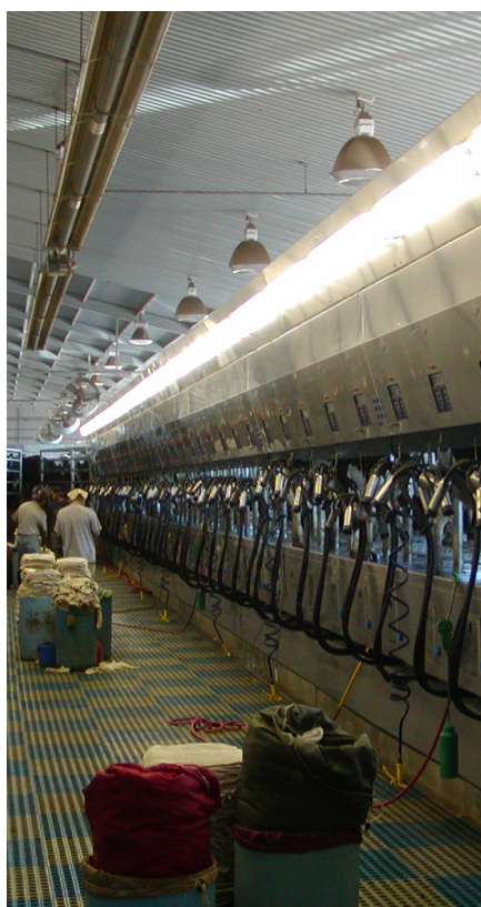
Milking parlor of a large dairy farm