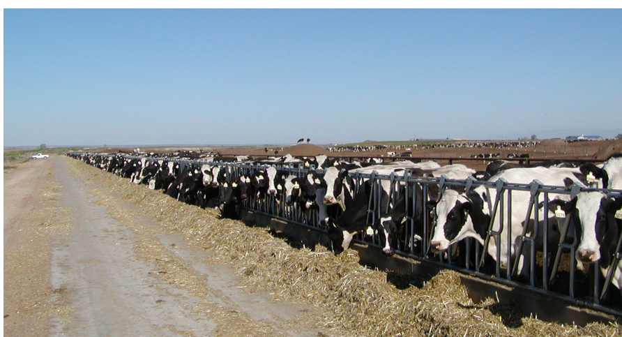
Intensive dairy farm in the Western United States

One of the most feasible and practical ways of decreasing GHG emission intensity from animal agriculture is through increasing animal productivity. The US dairy industry is an excellent example of the impact this can have on emissions intensity.