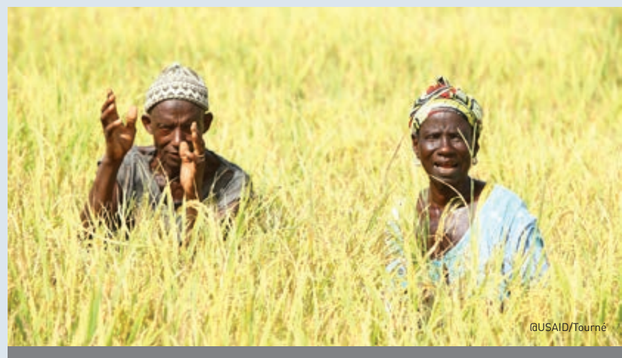
Smallholder farmers can increase productivity and reduce emissions through some management practices. Widespread adoption would contribute to sustainable development noals

CCAFS is the CGIAR's Research Program on Climate Change, Agriculture and Food Security. Its research aims to develop and scale up agricultural practices and policies that are adaptive to climate change, reduce greenhouse gas emissions and increase farmers' resilience. Over 200 scientists working in five regions of the developing world are part of the CCAFS program. CCAFS is an important partner for the LRG, with many shared priorities.