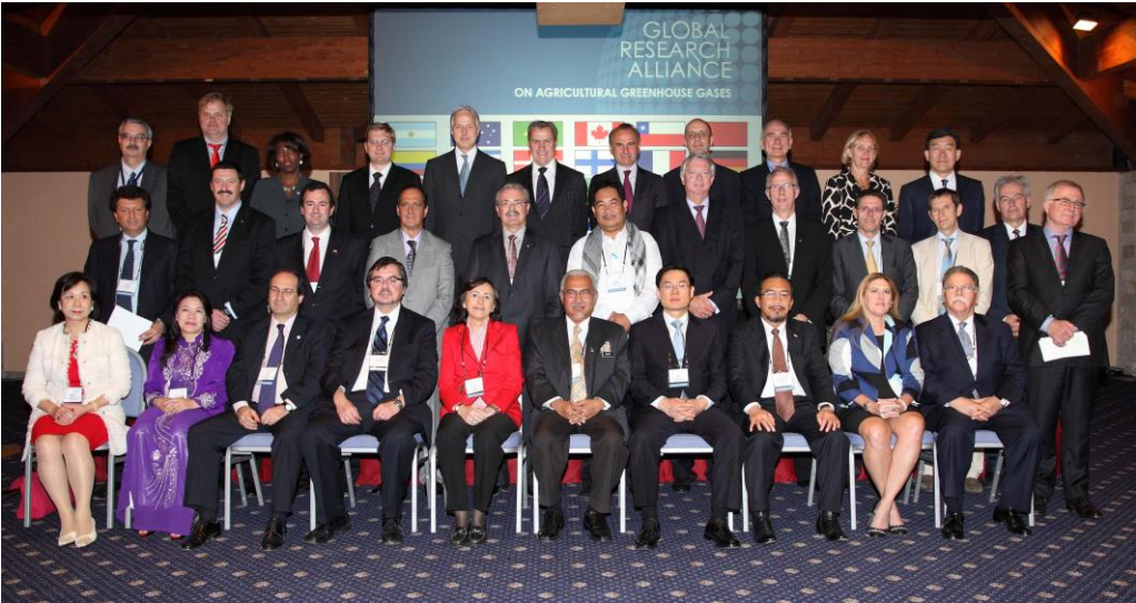
Heads of Delegations at the Alliance Ministerial Summit

This report is a summary of Summit participation and proceedings.