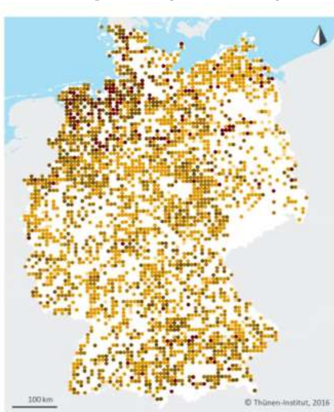
topsoil (0-30 cm)