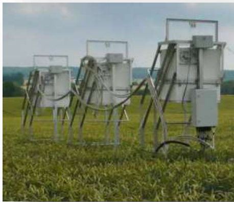
call on cropland