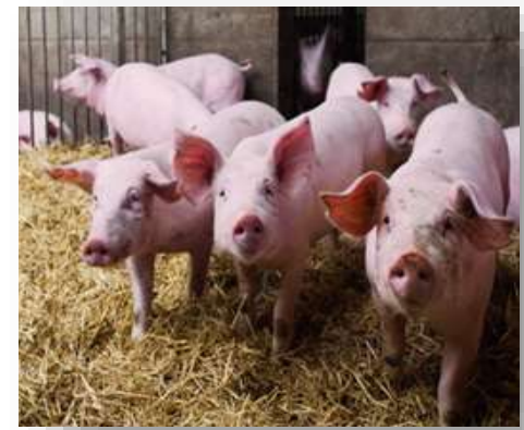
call on livestock