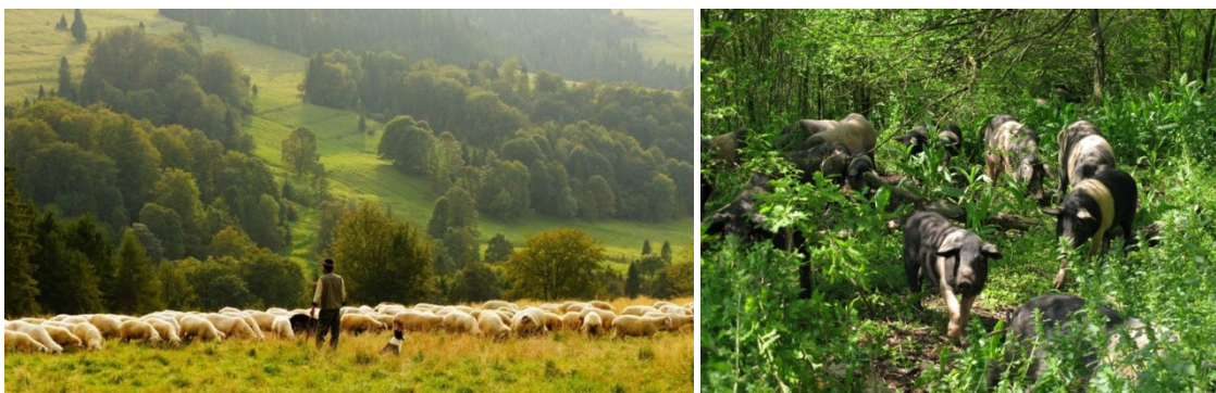
Figure 1: On the left, shepherd tends to sheep in a silvopastoral landscape – farmland that combines trees and livestock and on the right, Cinta Senese pigs grazing and foraging freely in a semi-extensive system in central Italy.

Discover more about AGROMIX in its Website , Twitter , LinkedIn , Instagram , Flickr and in this Publication in REVOLVE Magazine .