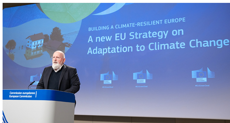
Figure 2: Executive Vice-President for the European Green Deal, Frans Timmermans during the presentation of the new EU strategy on adaptation to climate change as part of the Green Deal on 24th February 2021.