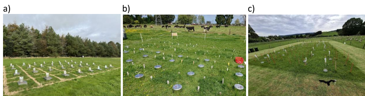
Photo 1. View of REEFIR study sites, 2025 a) Johnstown Castle, IE, b) Ruakura, NZ, and c) Invermay, NZ.

Over the last year, the REEFIR project has been busy on three fronts. The first relates to the gathering of data from fertiliser studies conducted across many different countries – data include emission factors, plus key soil and climate variables. This data will be used to develop revised emission factors. The database now contains over 800 emission factors, with the next phase focusing on completing the collation and quality control, followed by statistical analysis. Secondly, good progress is being made with employing process-based models (DNDC, DayCent, APSIM) to develop higher tier emission factors. The current work effort is focusing on ensuring the models describe key soil processes adequately before exploring the models' ability to simulate N 2 O emissions from soil. Thirdly, field experiments have been completed in both IE and NZ (Photo 1), with the data now being collated for future modelling purposes. The REEFIR research team also met for a week in NZ in December 2025, where plans were made for the next 12 months. The research team is made up of PhD students, post-doctoral fellows, junior scientists and not-so-junior scientists (Photo 2).