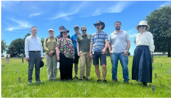
Photo 2. REEFIR project team workshop, held in December 2025 (Hamilton, NZ).

The N4R project is in its second year of implementation. A unified Greenhouse Gas (GHG) measurement protocol was agreed upon following a kick-off meeting and hands-on workshop. Seven field trials have been established across Latin-America, three in Argentina (maize and perennial pasture), and one each in Chile (pasture, Photo 3a), Peru (potato), Dominican Republic and Panama (horticultural systems). These trials are assessing N fertilisation strategies, focusing on practical mitigation options to reduce gaseous N losses and provide emission factors for the countries involved. Results are expected to inform more efficient fertiliser use and support the development of evidence-based policies for climate-smart agriculture in the region. Outreach and capacity-building activities have included field days, and participation in scientific conferences, along with two conference abstract publications. A key milestone was a regional workshop and training on N gaseous emissions held in Chile (Photo 3b), with participation of project representatives from all participating countries.